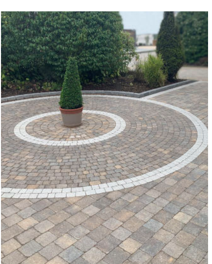
Get as much of the overall area in the image