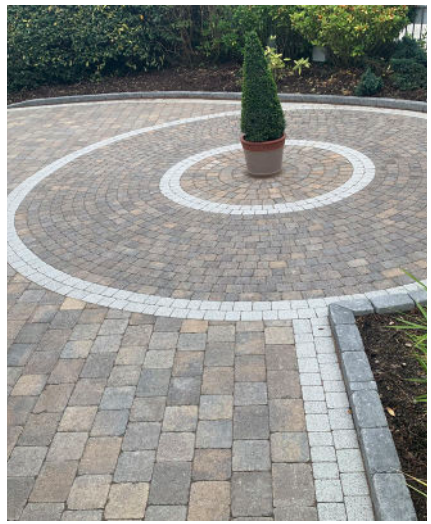
Provide a couple of different angles of the overall area.