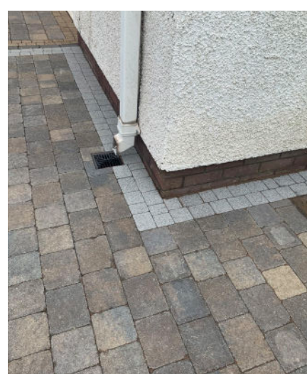
Show the drainage (gullies, drainage channels etc )