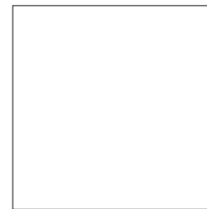
400 x 400mm