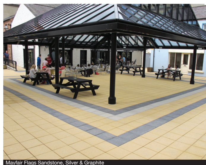
Mayfair Flags Sandstone, Silver & Graphite