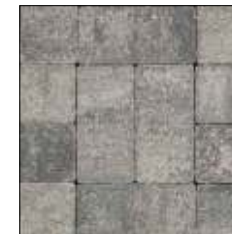
SLATE (ONLY AVAILABLE IN 50MM)