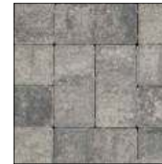
SLATE (ONLY AVAILABLE IN 50MM)