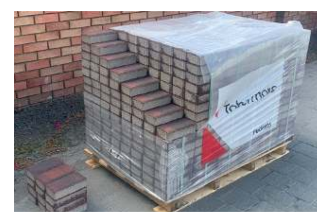
Image 1 - Select blocks by working diagonally down through each slice of the pack.

When products are supplied in packs with vertical slices select the product simultaneously from a minimum of three packs. Always select the product "diagonally and vertically slice by slice" as this ensures colours, shades and textures are distributed evenly over the entire installation. See images 1 & 2.