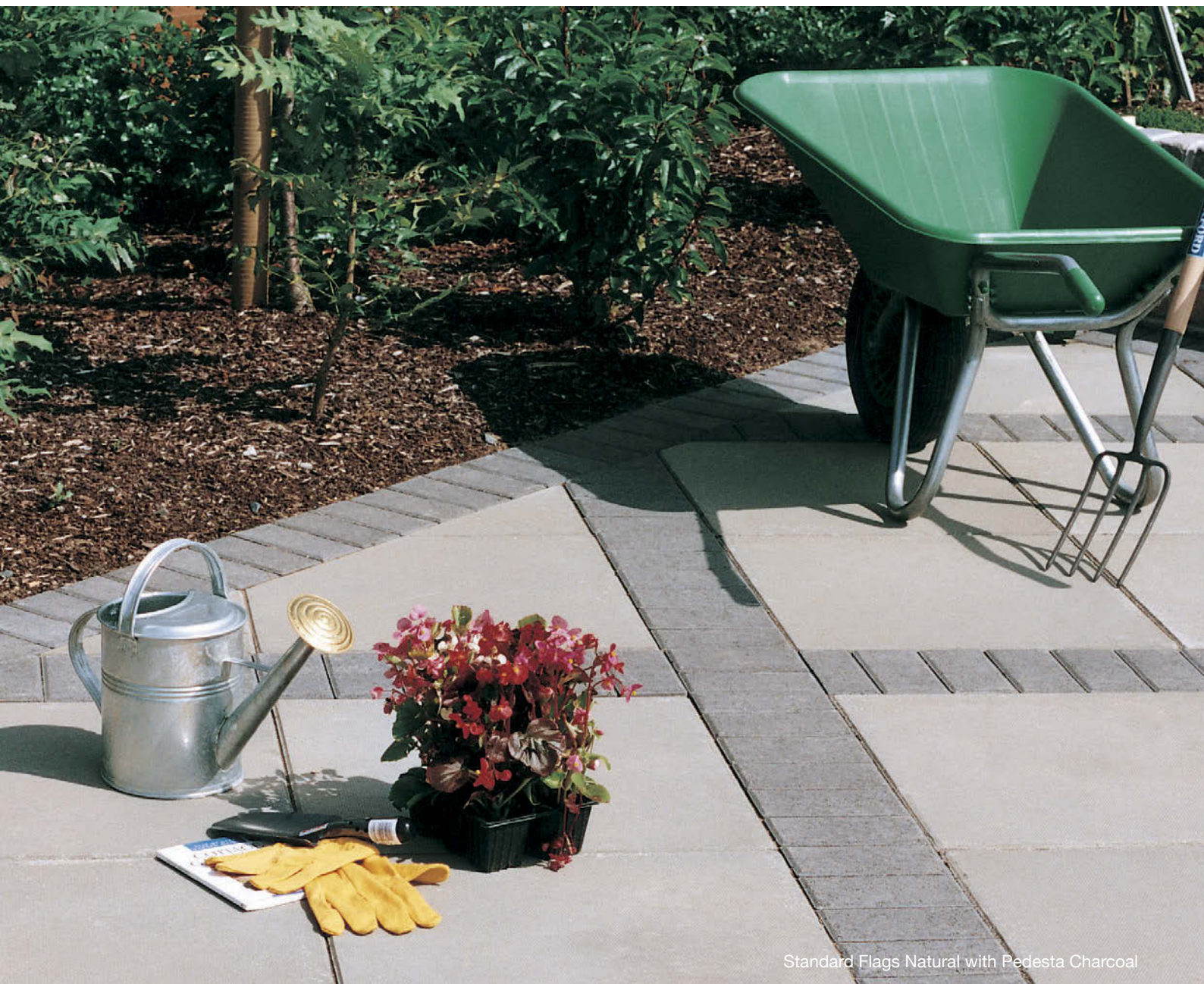
Standard Flags Natural with Pedesta Charcoal