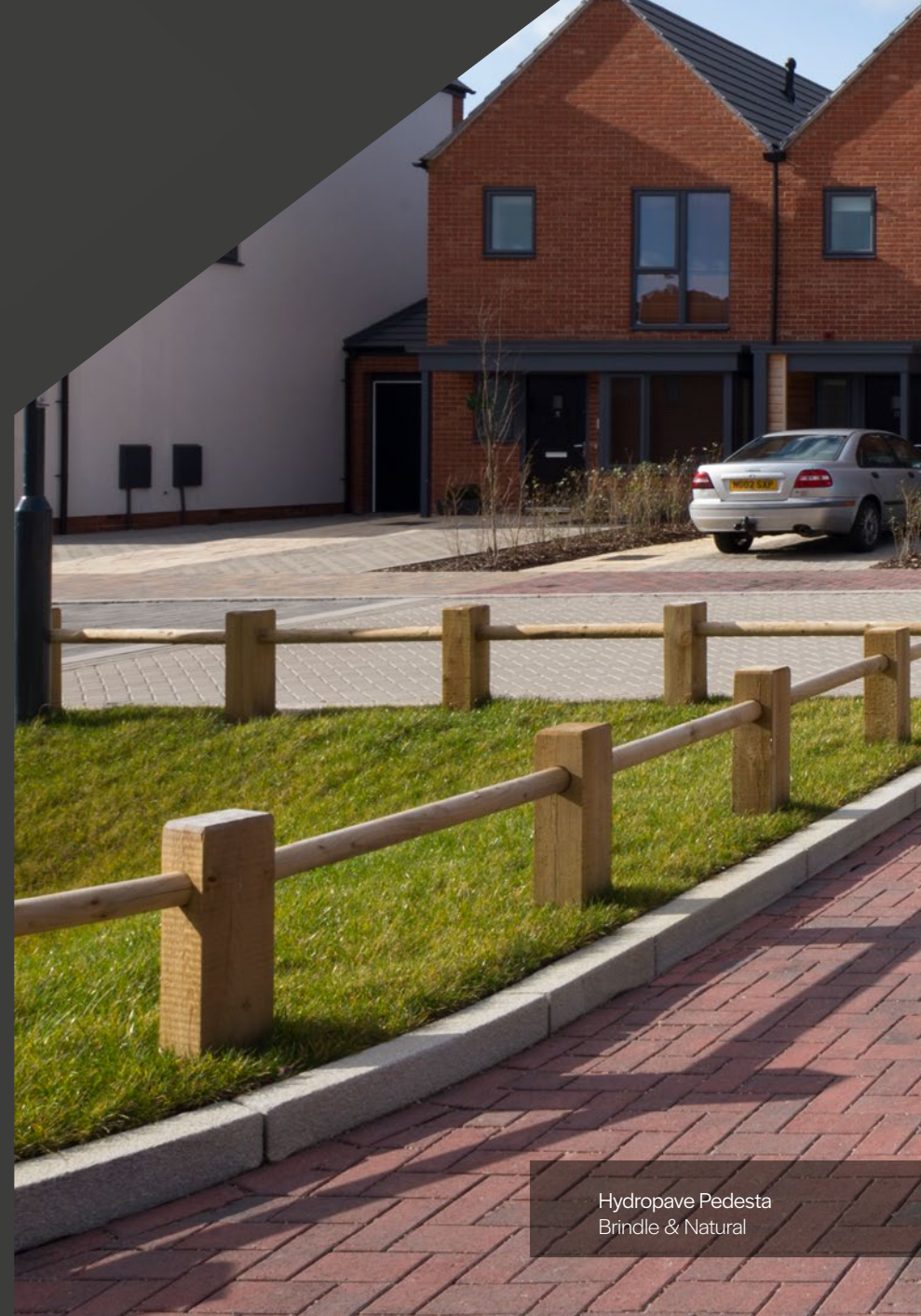
Hydropave Pedesta Brindle & Natural