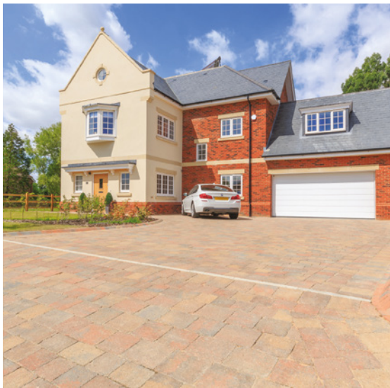
Tegula Trio Heather & Kerbsett Heather

Hydropave is a permeable paving system that reduces the risk of flooding and pollution. Available in the Tegula range.