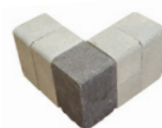
Bullnosed 90° Angle External

Note: The colour of Kerb Specials may slightly vary to the normal Kerbs.