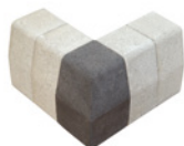
Half Battered 90° Angle External