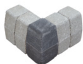
Half Battered 90° Angle External