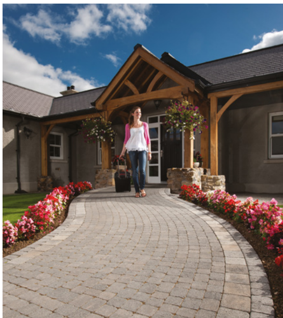
Tegula & Tegula Setts Slate