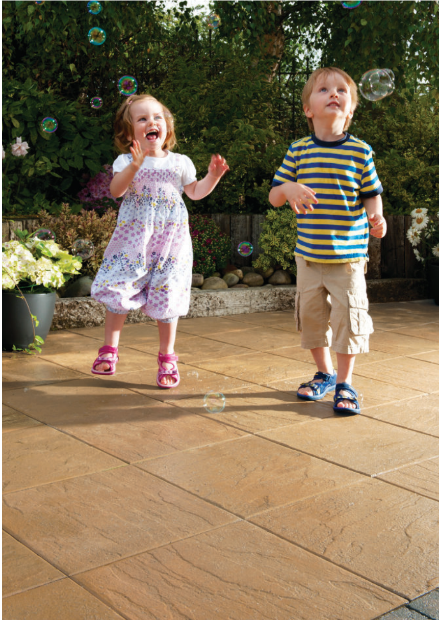
Riven Flags Golden