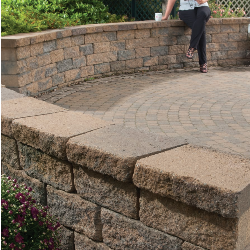
Garden Stone Bracken with Garden Stone Coping Bracken