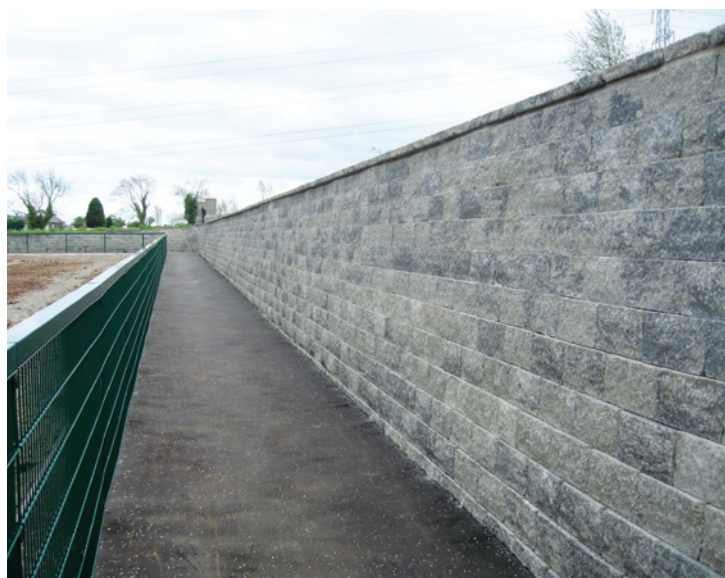
Secura Grand Slate

Secura Grand segmental retaining wall system BBA Roads and Bridges certified