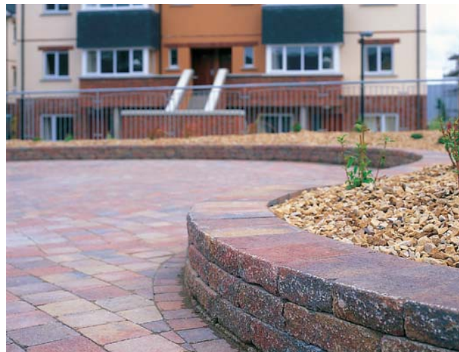
Secura Minor Heather