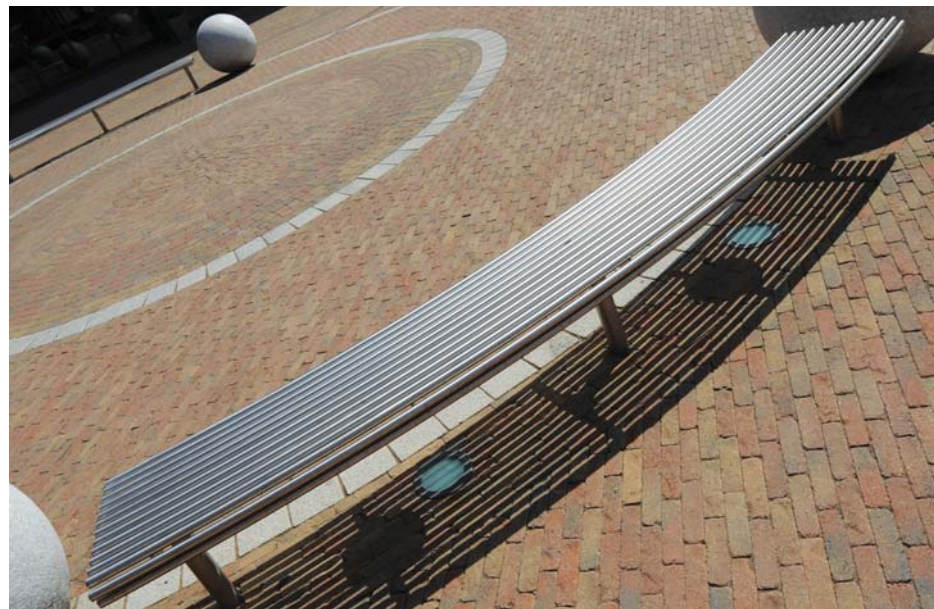
Craigavon Civic & Conference Centre: Retro 60mm Heather, Tegula Circle Heather with bands of Sienna 60mm Silver