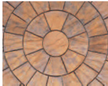
WEATHERED YORK CIRCLE