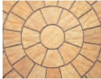
HARVEST GOLD CIRCLE