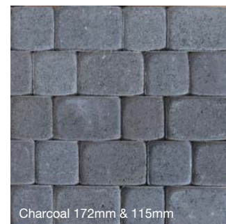
Charcoal 172mm & 115mm