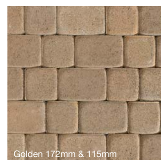
Golden 172mm & 115mm