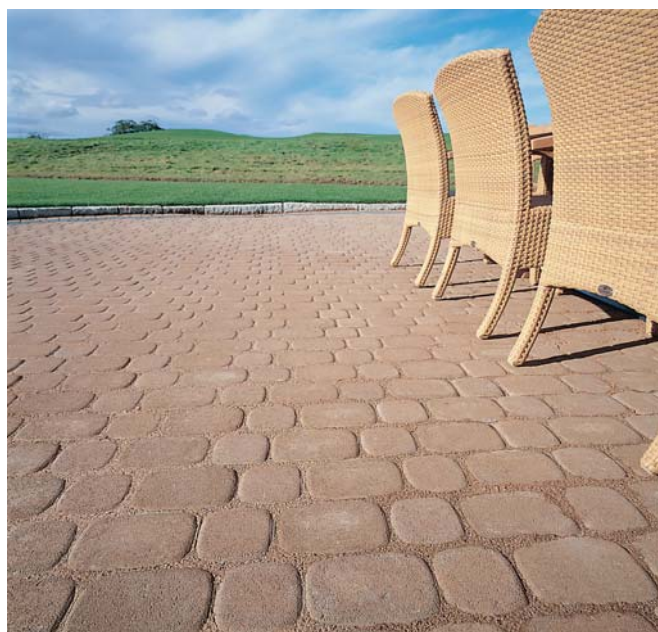
Mourne 60mm Golden

Tobermore operate an Integrated Management System and is an accredited ISO9001:2000 and ISO14001:2004 company.