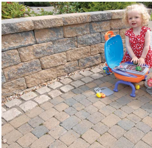
Garden Stone Bracken