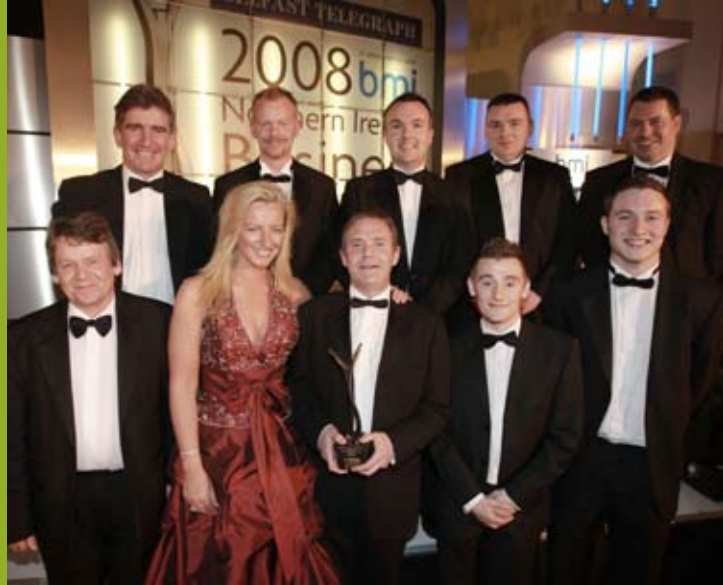
Belfast Telegraph 'Business Team of the Year Award 2008'